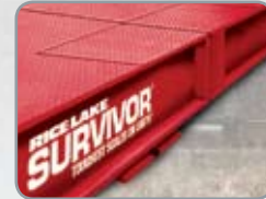
SURVIVOR ® OTR Top access, low profile concrete or steel deck scales