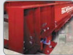
SURVIVOR ® SR Extreme-duty, low profile concrete or steel deck siderail scales