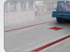
SURVIVOR ® PT Pit-type concrete or steel deck scales