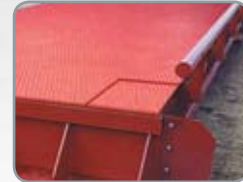
SURVIVOR ® ATV Heavy- and super-duty top access or siderail