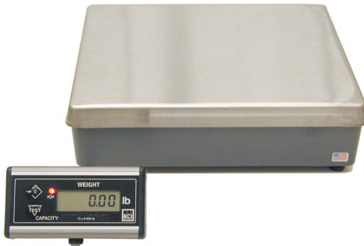
NCI Model 7820R shown with standard flat shroud