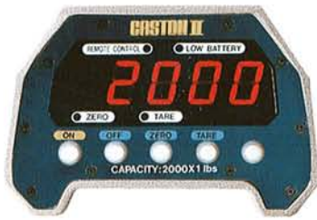
▲ Display & Keyboard