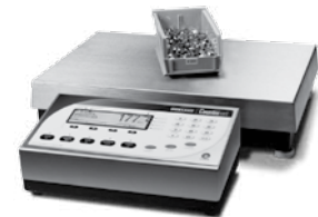
Shown with BenchMark® Scale Base and Bracket