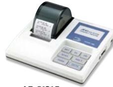
AD-8121B Dot Matrix Compact Printer